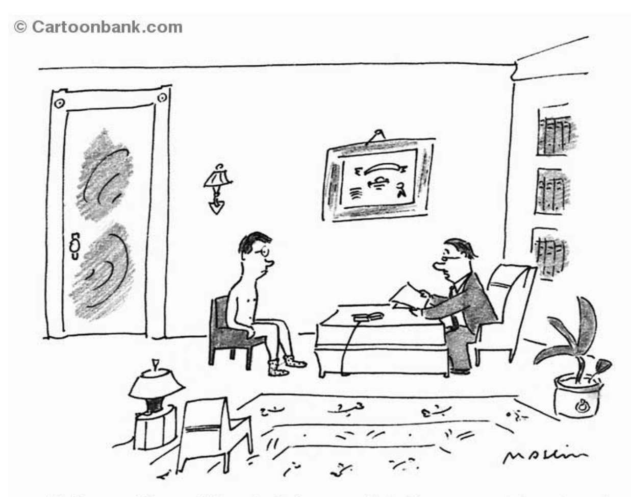
"Bad news, Kenny. When the judge awarded all your material goods and possessions to your wife, that included your socks."