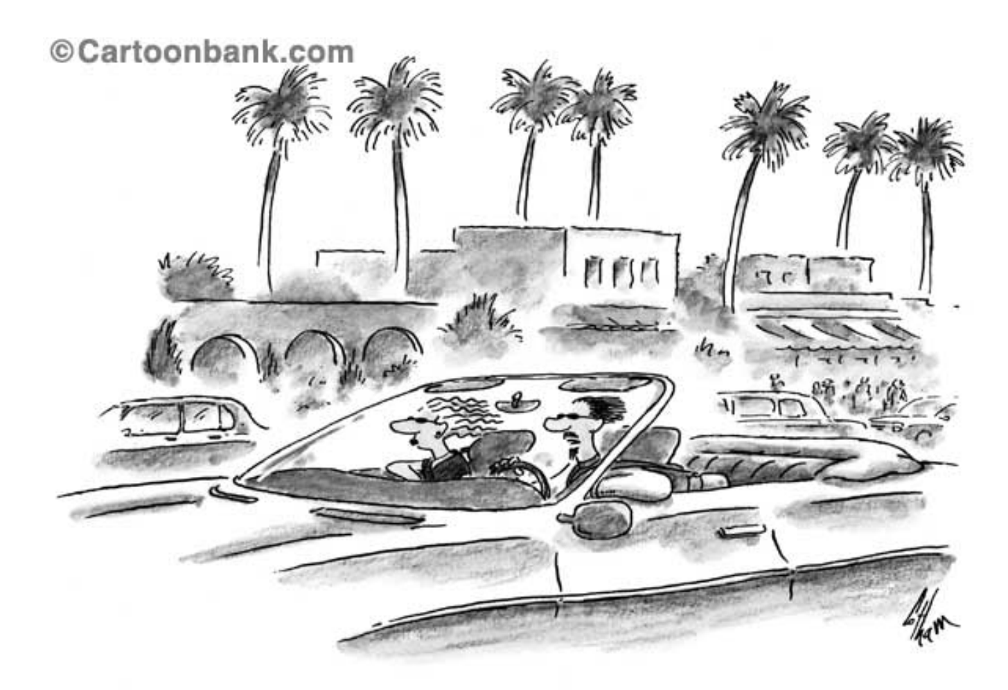
"We've been married a long time in Hollywood years."