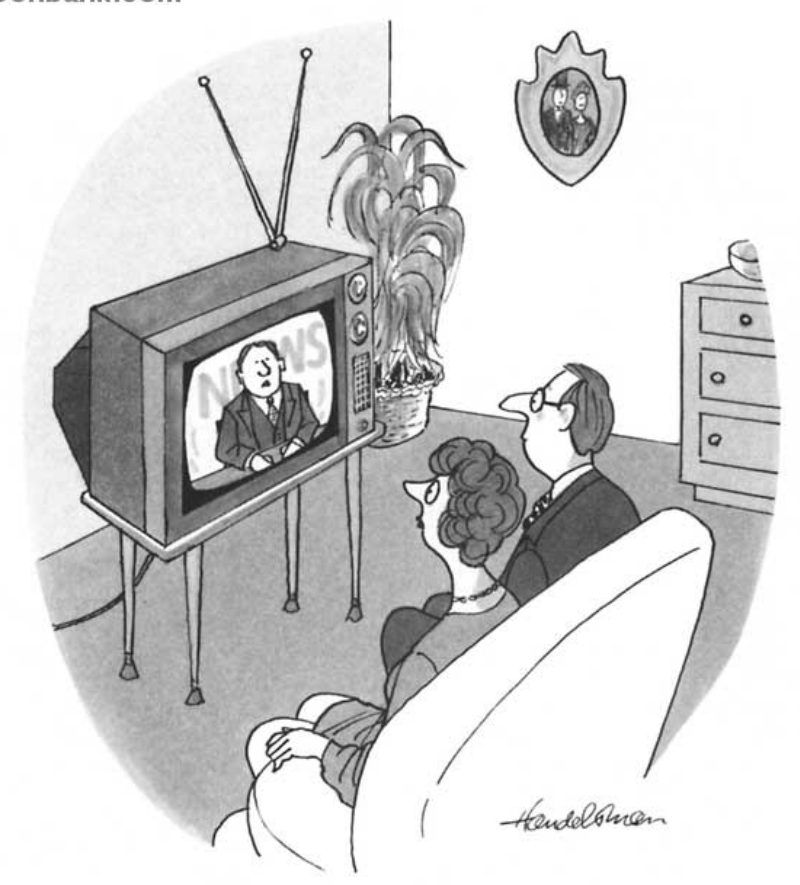
"This will surely be disappointing to many meek people. The legacy has been successfully contested, and it is now the arrogant who are to inherit the earth."