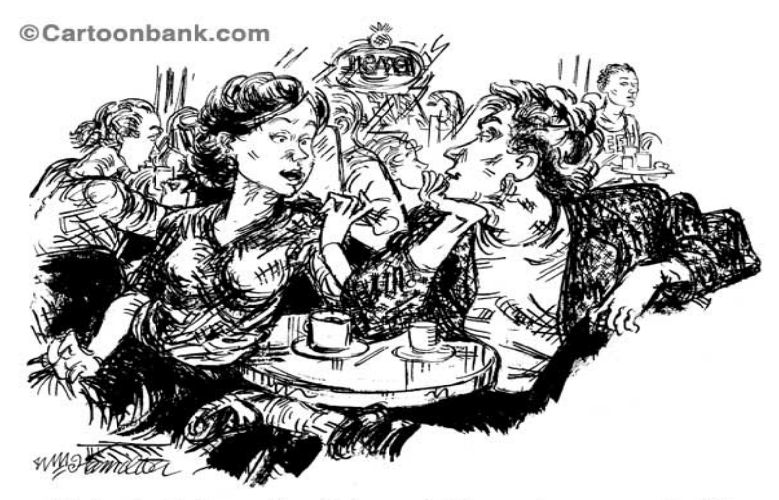
"Omigod—that's your dirty little secret? That you have a trust fund?"